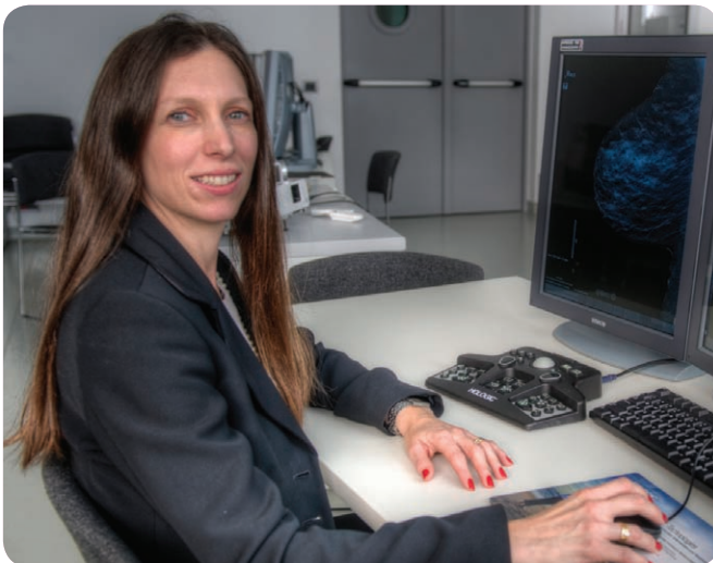
Dr. Schivartche believes that tomosynthesis in a screening environment would not only significantly decrease patient recall rates, but also radiologists would find more cancers than they do with just 2D.

"We saw cancer that was detected only on tomosynthesis. In addition, some cancers that might have been missed due to observation problems are easily seen on tomosynthesis."