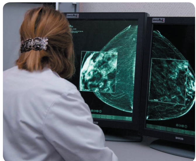
CHU Tivoli Hospital radiologists say they can see abnormalities better with tomosynthesis than with two-dimensional mammography, and they are finding smaller cancers earlier.

"Three years ago I only found three or four architectural distortions in a year. Now I find 50 in a year."