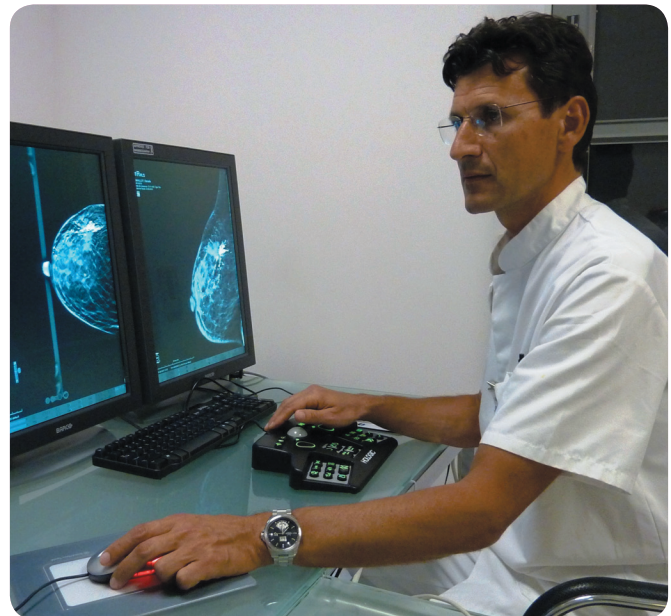
Dr. Tourasse uses tomosynthesis to provide better clarity of a suspicious image caused by overlapping tissue on women with dense breasts.

"Hologic's Selenia Dimensions system is easy to use, we can include tomosynthesis in our workflow for routine mammograms."