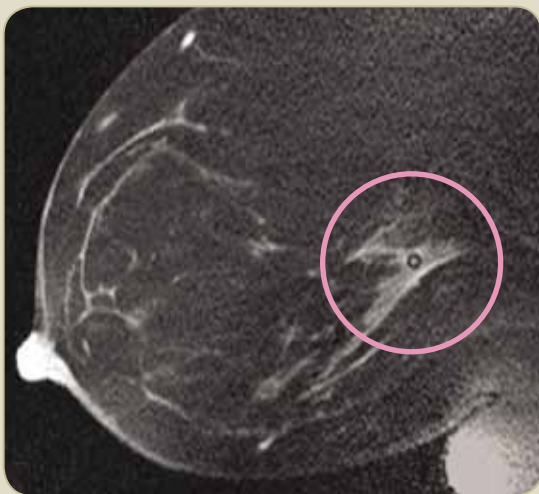
SureSight in the sagittal view looks like a bullseye.