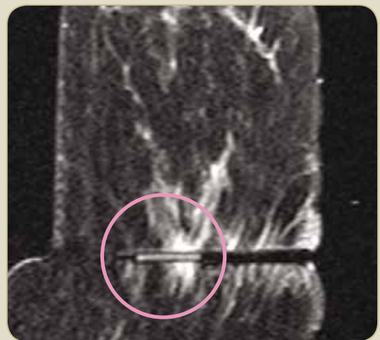
SureSight in the axial view shows where the needle aperture will be during biopsy.