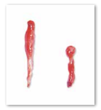
Celero device core, more than 2x the tissue vs. 14g spring loaded-core<sup>1</sup>