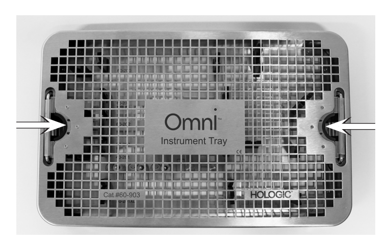
SQUEEZE LEVERS TO UNLOCK LID

The Omni Instrument Tray must be used in conjunction with a sterilization wrap that is cleared by FDA for the indicated sterilization cycles.