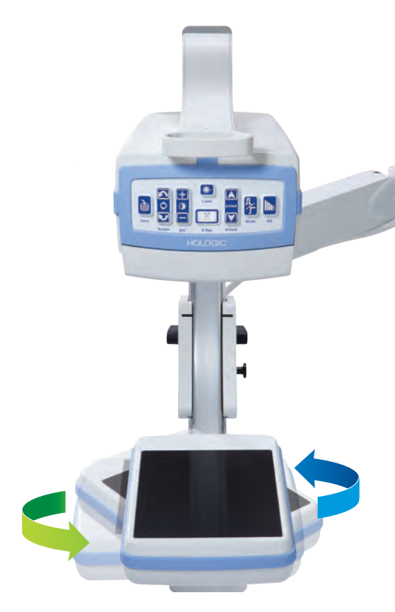
Flat detector rotation is an industry exclusive from Hologic.