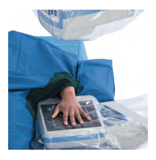
Flat detector sweet spot insures the anatomy of interest is always within the field of view.