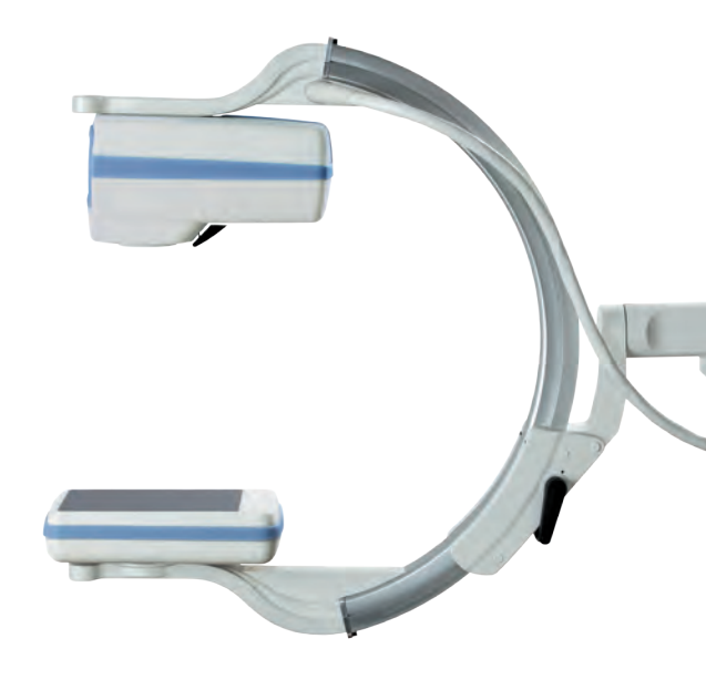
20" (50.6 cm) arch depth & thin profile for table-top positioning.