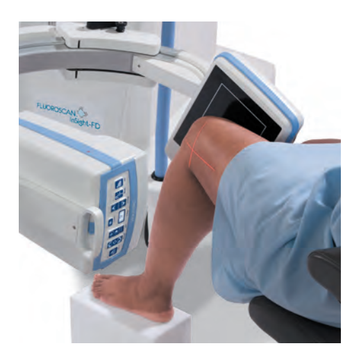
Exclusive rotating detector and user-friendly sterile field controls meet surgeons' needs.