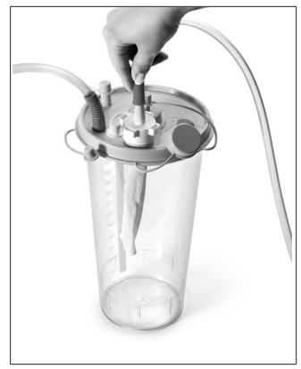
FIGURE 4. ATTACH VACUUM TUBE TO COLLECTION CANISTER