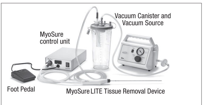
FIGURE 2. SYSTEM CONFIGURATION

1. Review the System Configuration Diagram in Figure 2 for set-up outline.