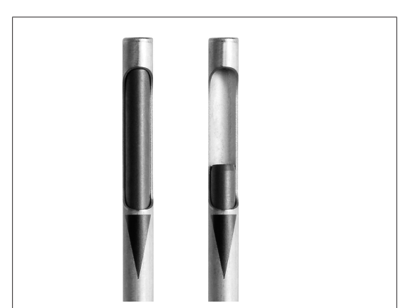
FIGURE 5. CLOSED TISSUE REMOVAL DEVICE CUTTING WINDOW ON LEFT

WARNING: Periodic irrigation of the tissue removal device tip is recommended to provide adequate cooling and to prevent accumulation of excised materials in the surgical site.