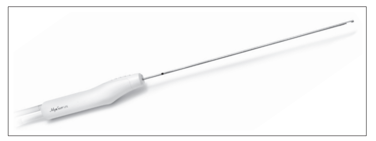
FIGURE 1. MYOSURE LITE TISSUE REMOVAL DEVICE

The MyoSure LITE Tissue Removal Device is shown in Figure 1. It is a hand-held unit which is connected to the control unit via a 6-foot (1.8-meter) flexible drive cable and to a collection canister via a 10-foot (3-meter) vacuum tube. Cutting action is activated by a foot pedal. The tissue removal device is a single-use device designed to hysteroscopically remove intrauterine tissue.