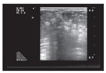
Ultrasound image of deflated MammoSite balloon