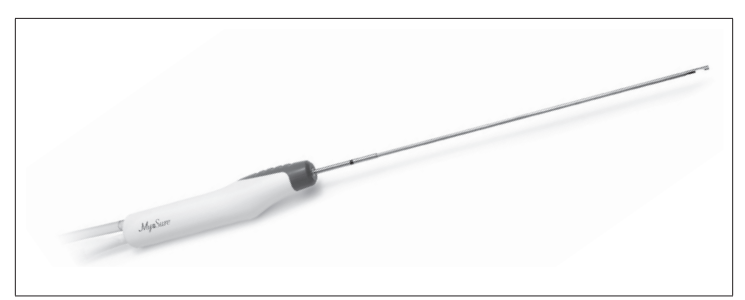
FIGURE 1. MYOSURE TISSUE REMOVAL DEVICE

The MyoSure Tissue Removal Device is shown in Figure 1. It is a hand-held unit which is connected to the control unit via a 6-foot (1.8-meter) flexible drive cable and to a collection canister via a 10-foot (3-meter) vacuum tube. Cutting action is activated by a foot pedal. The tissue removal device is a single-use device designed to hysteroscopically remove intrauterine tissue.