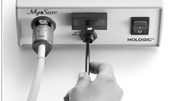
FIGURE 3. INSERT DRIVE CABLE AND FOOT PEDAL INTO CONTROL UNIT

CAUTION: DO NOT attempt to sharply bend the flexible drive cable in a diameter of less than 8 inches (20 centimeters). A sharply bent or kinked drive cable may cause the control unit to overheat and stop. During a procedure, a minimum distance of 5 feet (1.5 meters) should be maintained between the control unit and the tissue removal device to allow the drive cable to hang in a large arc with no bends, loops, or kinks.