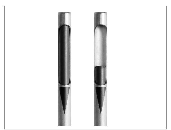
Figure 5. Closed Tissue Removal Device Cutting Window on Left

WARNING: Periodic irrigation of the tissue removal device tip is recommended to provide adequate cooling and to prevent accumulation of excised materials in the surgical site.