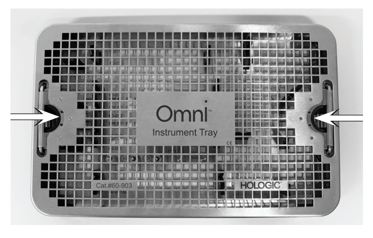
SQUEEZE LEVERS TO UNLOCK LID

The Omni Instrument Tray must be used in conjunction with a sterilization wrap that is cleared by FDA for the indicated sterilization cycles.