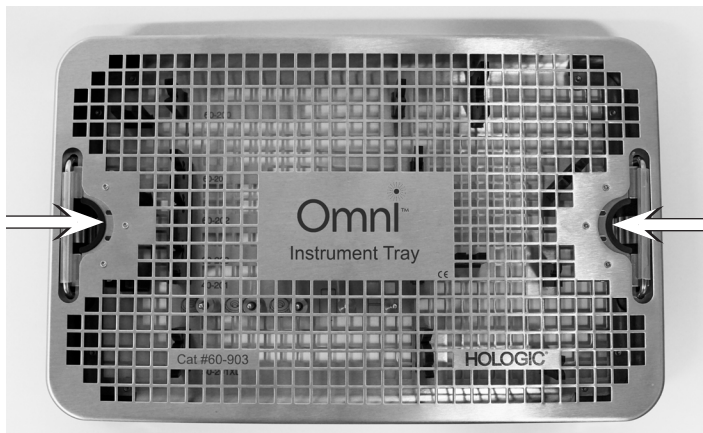
SQUEEZE LEVERS TO UNLOCK LID

The Omni Instrument Tray must be used in conjunction with a sterilization wrap that is cleared by FDA for the indicated sterilization cycles.