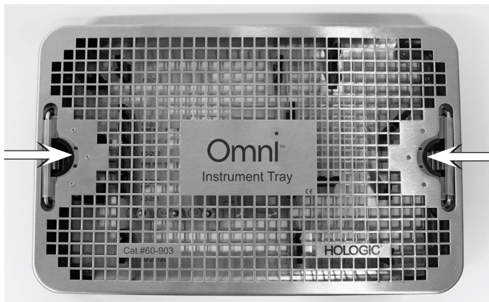
SQUEEZE LEVERS TO UNLOCK LID

The Omni Instrument Tray must be used in conjunction with a sterilization wrap that is cleared by FDA for the indicated sterilization cycles.