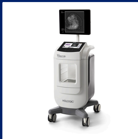
Trident® HD specimen radiography system