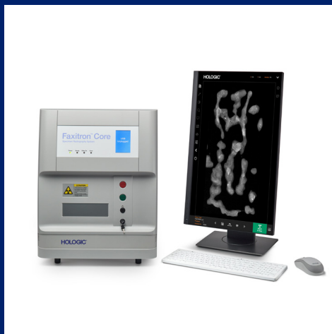
Faxitron™ Core specimen radiography system